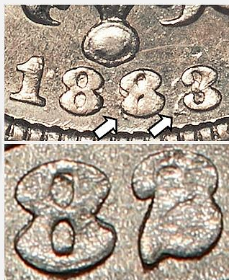
1883/2 Shield Nickel along with date enlargement and a common 1882 Filled 2 for comparison